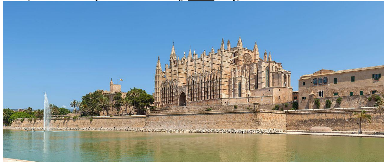
Palma's waterfront and magnificent Cathedral

<u>Day 3 - Tuesday, February 11</u>: After our buffet breakfast, leisurely walking tour of Palma de Mallorca, a beautiful and vibrant city of approximately 400,000 inhabitants, and capital of the island of Mallorca and of the Balearic Community, one of Spain's autonomous regions. We focus on the historical city centre, and among the highlights will be the magnificent Gothic Cathedral, Placa Major, San Francisco Church with its fine cloisters, the narrow streets of the Gothic Quarter, the wide Bom Boulevard, reminiscent of Barcelona's Rambla, the seafront park (Parc de la Mar), and the harbour, bustling with sailboats and other pleasure craft. The afternoon is free to explore the town on your own. This evening, <u>dinner</u> in a typical restaurant!