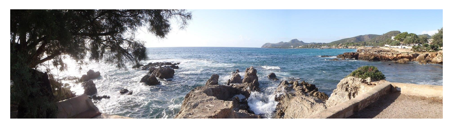
Coastal scenery near Cala Ratjada