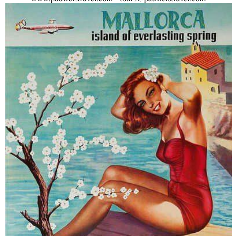
All illustrations free of copyright c/o Wikimedia Commons

Pauwels Travel Bureau Ltd. 55 Dufferin Avenue, Brantford, Ontario N3T 4P6 Tel: (519)756-4900, 1-800-380-3974 - Fax: (519)753-6376 www.pauwelstravel.com - tours@pauwelstravel.com