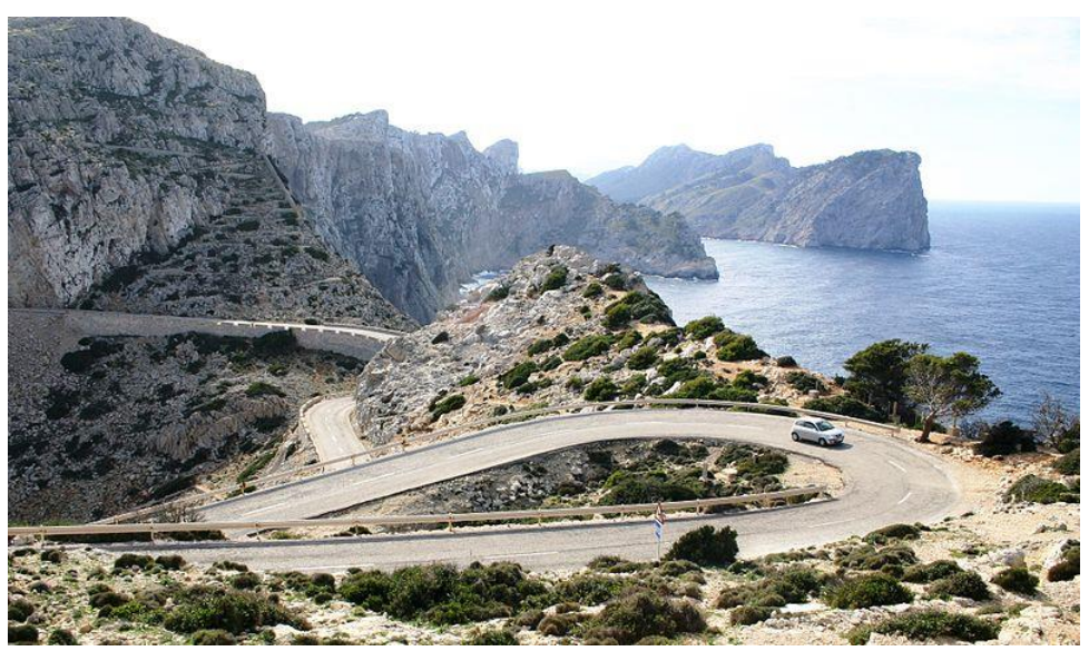
The road along Mallorca's rugged western coast

Mallorca enjoys a mild and sunny Mediterranean climate, with lots of sunshine and very little rain. In February, the temperature (at sea level) oscillates between a cool 10-11° and balmy low twenties C, with a daily mean temperature of 18° C.